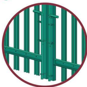
Padlockable Drop Bolt (on reverse of gate)