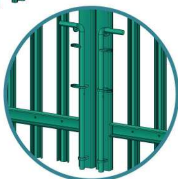
Padlockable Drop Bolt (on reverse of gate)