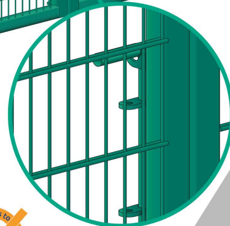
Padlockable Drop Bolt Detail