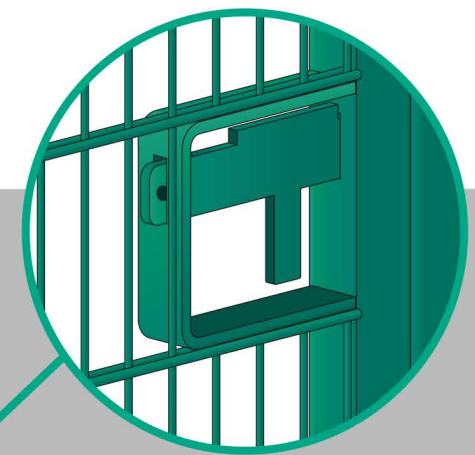
Padlockable Slide Bolt Detail