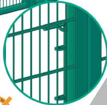
Padlockable Drop Bolt Detail