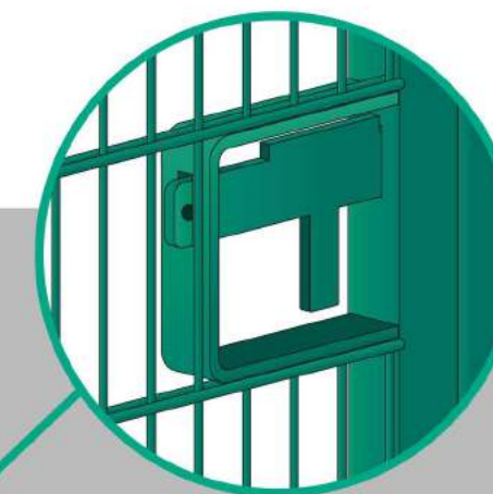
Padlockable Slide Bolt Detail