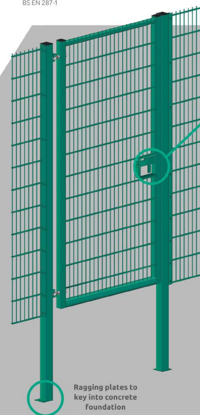
Ragging plates to key into concrete foundation