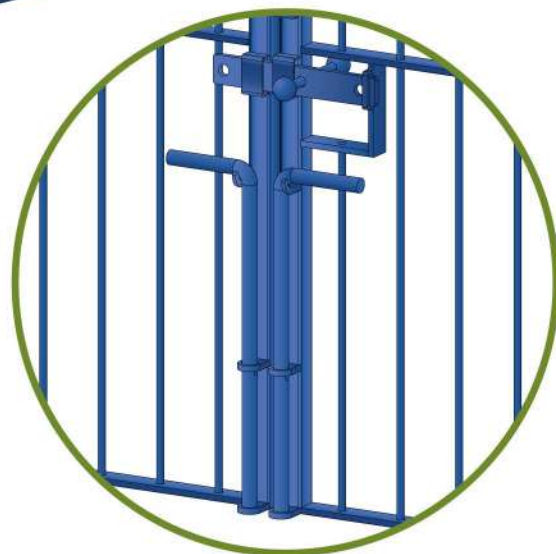
Padlockable Drop Bolt (on reverse of gate)

Suitable For: Public parks, schools, residential