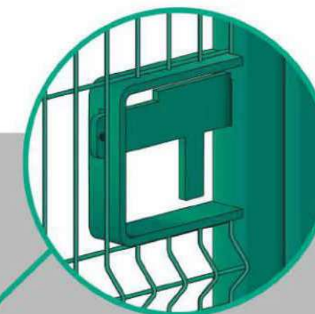
Padlockable Slide Bolt Detail